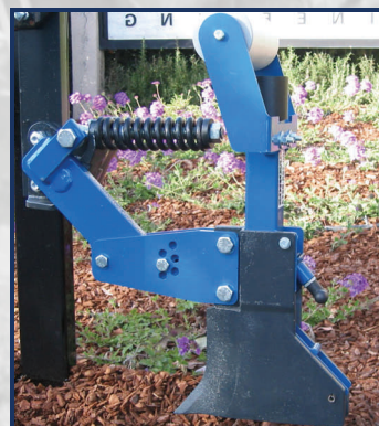
SI1001-001 Ag-Tip SBA