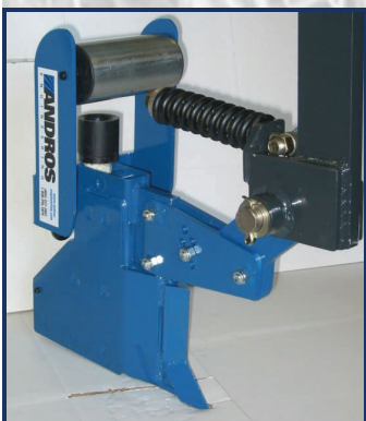
SI0805-001 Double Chamber Fertilizer/Tape Layer Break-Away Tool

*All units include integrated inspection doors