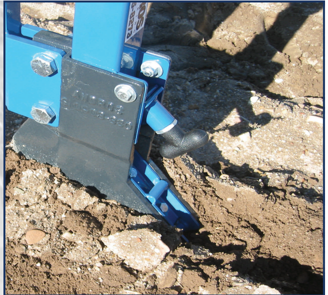
SI0909-001 Swept-back SBA

The tool can be mounted to any conventional tool bar and to most precision planters. This allows for very precise placement of tape in relationship to seed line or transplants.