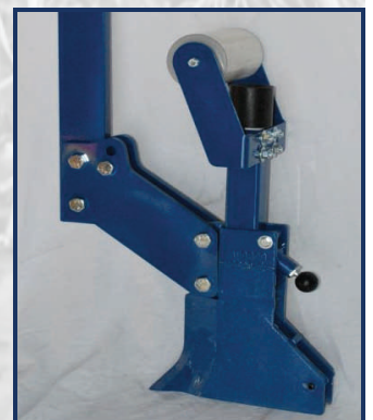
SI0804-008 Cast MBA Inj. Tool